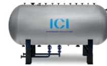
VEX Steam accumulator