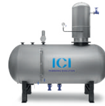
DEG/P Pressurized degasser