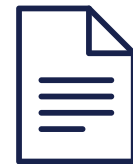
SERVICE LEVEL AGREEMENT 19 managed services, 3 levels of offering