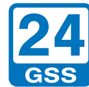
GSS 24 PLUS Steam safety system for exemption from operation for up to a maximum of 24 hours