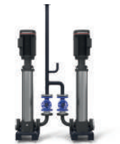
MODULATING WATER SUPPLY GROUP (Optional with Inverter on board pumps)