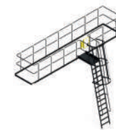
LADDER AND HANDRAIL