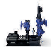
PMX Oil supply pumps