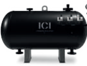
VEO Thermal oil expansion vessel